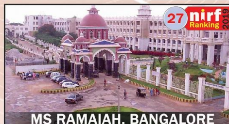
MS RAMAIAH, BANGALORE