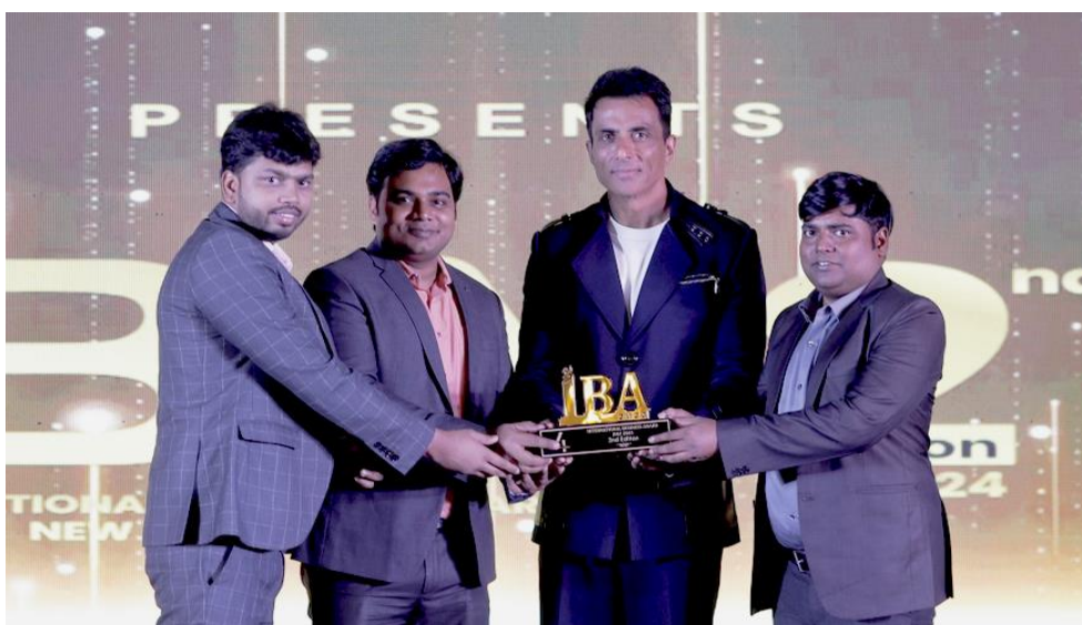
AWARDED BEST MEDICAL ADMISSION COUNSELLOR OF INDIA

Reflecting on our journey, we are proud of the service we have provided, guiding students towards achieving their professional dreams in medicine. Our success is not just in the numbers but in the difference, we make in the lives of the students we guide, ensuring they are placed in institutions that match their aspirations, capabilities, and potential for a successful medical career.