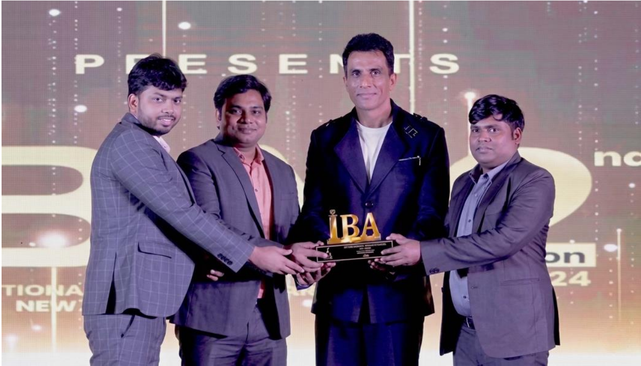
Awarded “Best Medical Admission Counsellor of India”